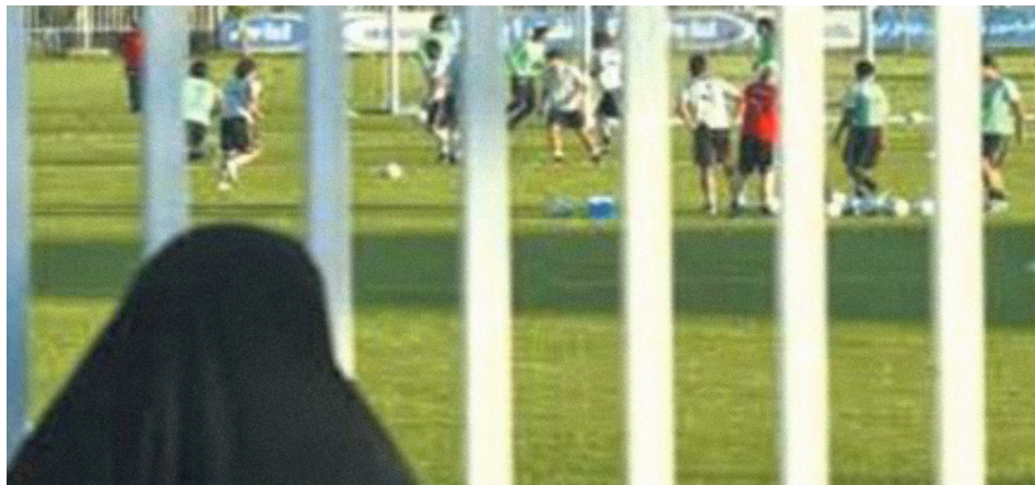
Illustration from the blog 'The Turbulent World of Middle East Soccer' of James M.Dorsey

TWO COUNTRIES FORBID WOMEN TO HAVE ACCESS TO STADIUMS: IRAN AND SAUDI ARABIA