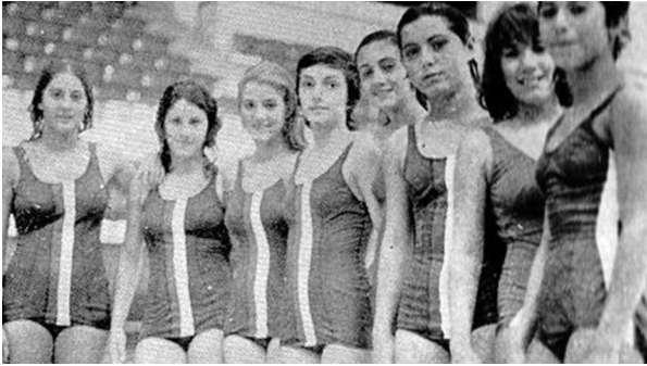
Iranian swimmers before...