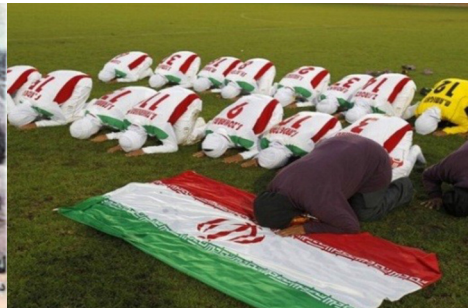
and after the Islamic revolution.