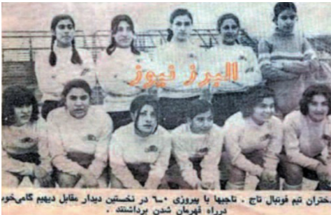
Iranian footballers before...