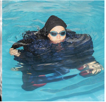
and after the Islamic revolution.