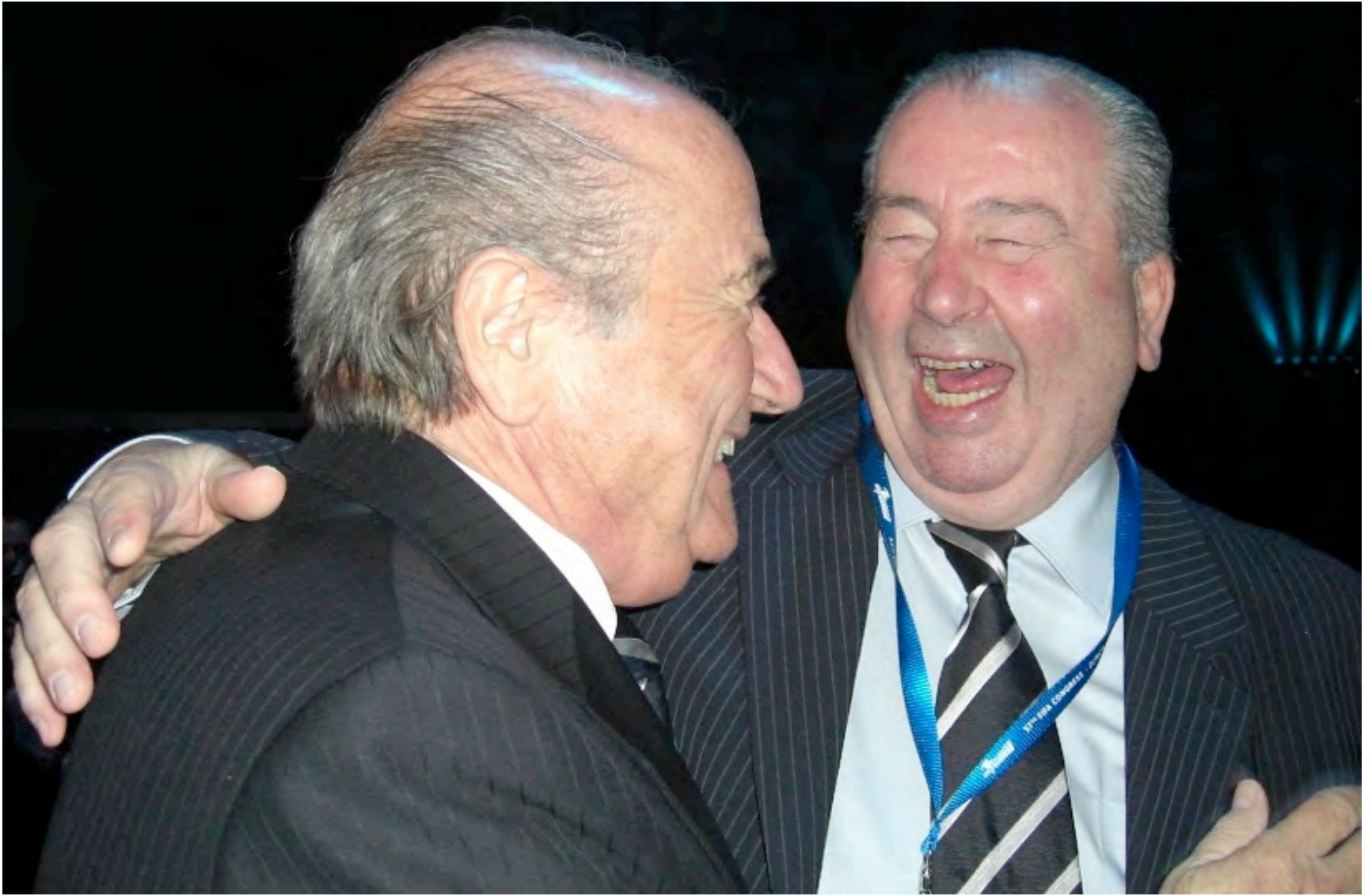
Mr Blatter, Don Julio Grondona